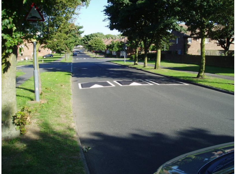
Tarmac speed cushions

To the north of the build out four sets of double speed cushions are proposed. The cushions will be similar to the ones in the photograph below.