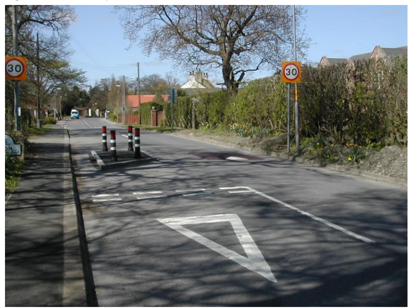
Scheme similar to the proposed gateways

A build out to reduce the width of the carriageway to allow on one vehicle to pass the feature; vehicles coming into the built up area from the south will be required to give way to vehicles travelling in a southerly direction.